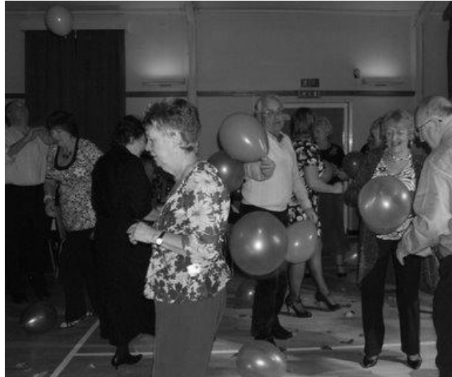
The post Christmas party in full swing